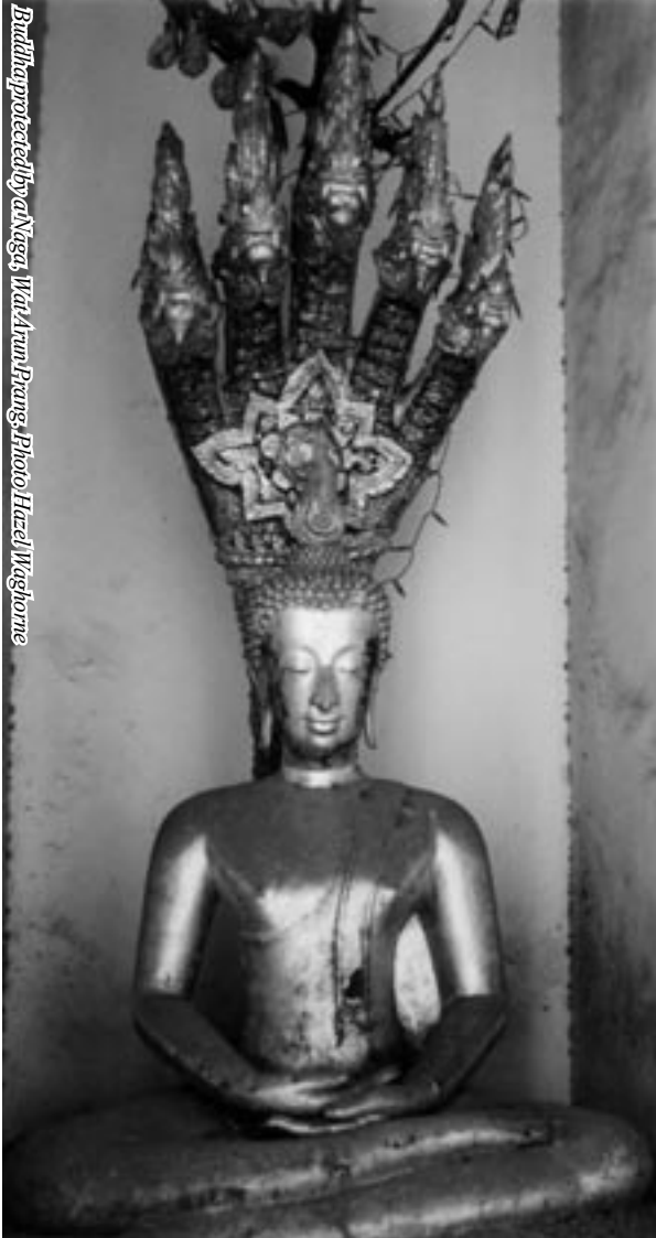
Buddhism protected by Naga, Wat Arun Prang

Sometimes metta is presented as a kind of 'think pink' idea, where we are just saying very nice things and wishing everybody well and it is all very sweet and nice, but underneath there might be a kind of volcano of rage and resentment.