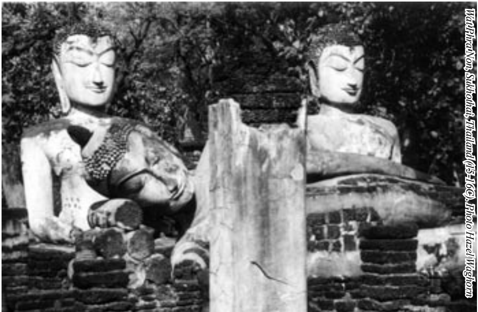
Wat Phnom, Siem Reap, Thailand (15-16).

The way to deal with feelings and emotions, then, is not through bypassing them, or judging or trying to change them, but through directly accepting them, knowing them for what they are. At first it is very difficult to do this because there is a lot of habitual resistance to emotions. Begin to notice what resistance is like, this tendency to dismiss or dislike emotional experience,