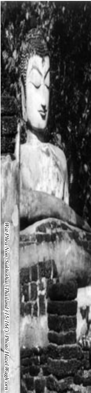
Wat Phra Non, Sukhothai, Thailand (15-16).

of spiritual development, nobody seemed to have even a slight inclination.